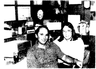
Abb. 6. Die Crew von N1NA: N1NA und G4BWP/W1

UA3DAM, UA3DLD, UA4ACA, UA4CCG, UA9AFO, UA9MQ, UA9UOZ, UA0LEO, UB5EAX, UB5FAP, UB5JGQ, UB5ZBG, UI8ADQ, UK7FAR, UK9ACP, UK9HAC, UK9YAU, UO5ODA, UP2BV, UR2OI, UA3TAG, UA6AJQ, UA0CDM, UR2RCU, UA3DHH, UA3AJR, UW9WB, UB5LCN, UP2BFE, UA0WAS, UA4HAU, UB5TAG, UV3FL, UA3ESN, UB5MDP, RP2BET, UA6LDF, UA9NW, UB5ZDF, UA9FGJ, UK5IEG, UA9FDW, UW3GL, UC2SLL, UA3EAT, UA3RO, UA3TAM, UA3ACU, UB5UWG, UA3ST, UB5UBI, UB5WCW, UM8NNN, WA3ADO, UK5QAC, UP2BGK, UM8MBN, UK3AAO, UD6DHC, DL8TV, OH2MM, OH6MM, OH5PT, OH1LU, SP9CAV, SP5EKY, SP7HOV, SP3XR, SP9CVY, SP6AYP, SP4JWR, SP4PHV, SP8EMO, SP8GSC, SP1DWZ, SM5AFE, SM0BDS, PA0CF, PA0PLM, PA0PN, LA2KD, OK3CTB, OK1MWN, OK1IAR, YU3TDI, DM5NH, DM4ZKF, DM4YYK, DM4YEL, DM4SDA/p, DM4PN, DM3ZUE, DM3YL, DM3XM, DM3VTL, DM3VPL, DM3UPL, DM3OML, DM5XIG, DM3MYF, DM3IGM, DM2AH/a, DM2DGE, DM2CKD, DM2FEI/p, DM2GDL, DM2GHL, DM2GIL, WB4BBH, W7YF, W6NNV, N1NN, YO6KEB, YO6VZ, YO8MH, LZ2KRR, LZ1PN.