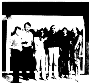
Abb. 2. Die Crew von DLÖKF; v.l.n.r. DJ6TK, DL2ZT, DK8LE, DJ7SW, DF3LP, DJ4FZ

UA-Europ. Russ. SFSR UK4FAV 455840 635 905 296 UK4FAD 253330 593 441 245 UK4WAC 80080 269 303 140