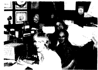
Abb. 7. Die Crew von N1NA: v.l.n.r. G4GIR/ W1, N1NA, G4BWP/W1