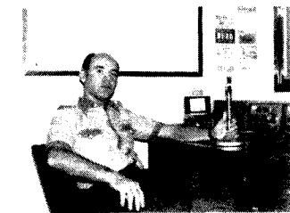
Abb. 1. LU1BR