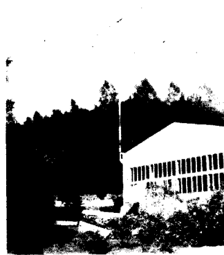
Abb. 2. Antennenanlage von DK5EZ: TH6 in 16 m Höhe, 4el 40 m in 12 m Höhe